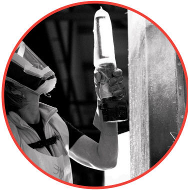
Creation of composite pieces *

From moulding to shipping, via polyester cutting, come and discover or rediscover the 4 main stages in the manufacture of a Jeanneau Sun Odyssey.