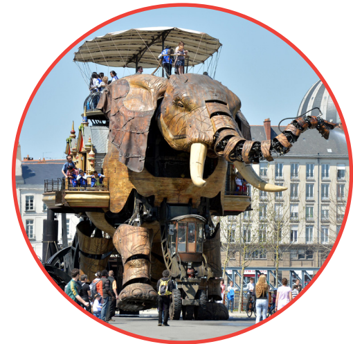
Machine de l'île de Nantes

Open every day from 8am to 8pm www.passagepommeraye.fr