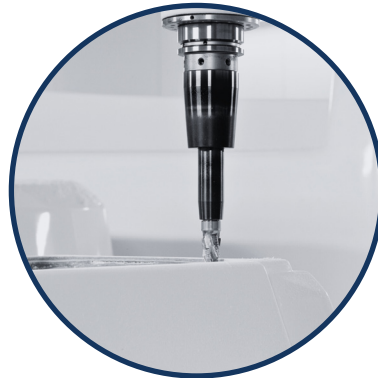
Finishing of composite pieces *

The 5-axel robot cuts out GRP parts, and after a first quality control check, the fiberglass pieces are finished.