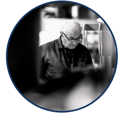
Preparation and shipping

The wooden elements are preassembled in the form of modules, and then installed in the hull of the boat, in an «open air» fashion.