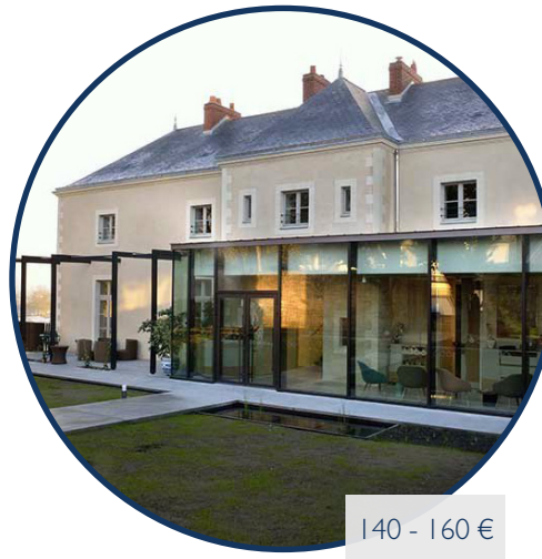
Maison Gueho (Chambres d'Hôtes)

Tel: 0033 2 72 00 10 00 www.radissonblu.com