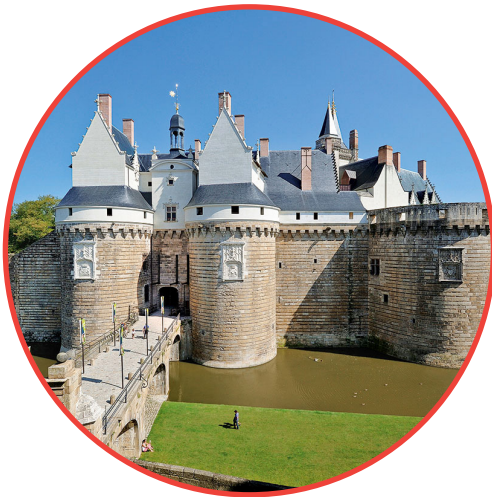
Château des Ducs de Bretagne

This information is given for information purposes only. It is the result of feedback from our customers and is not of a commercial nature.