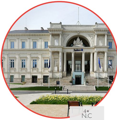
Radisson Blu Hotel

This information is given for information purposes only. It is the result of feedback from our customers and is not of a commercial nature.